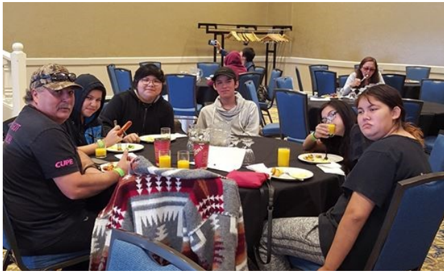
Breakfast with participants at Project Hope