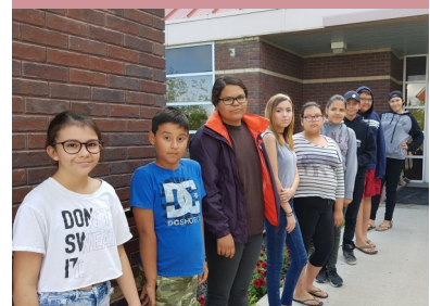
Babysitting Certification Graduates